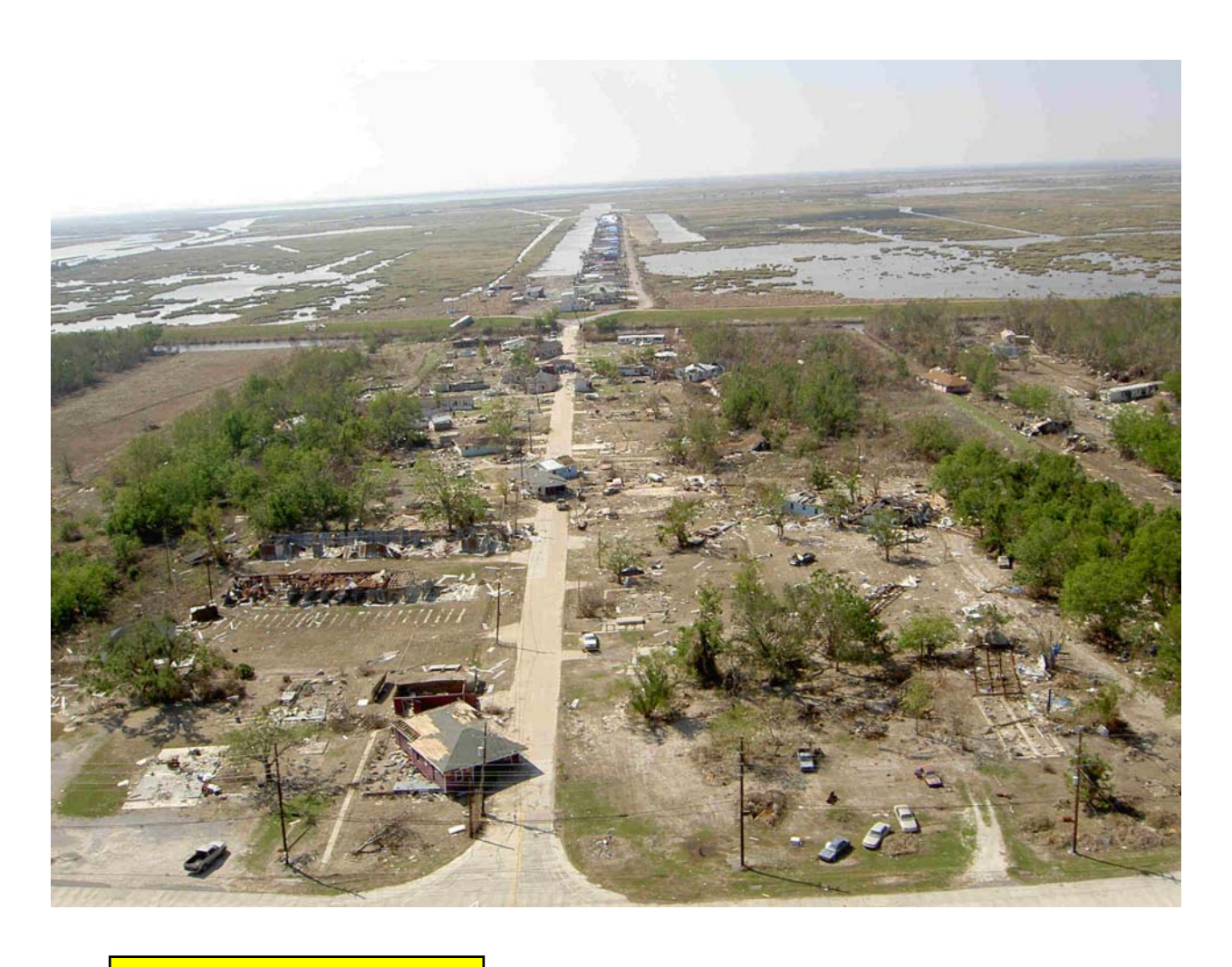
Town in Placquemines Parish